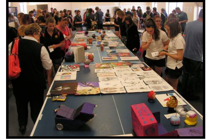
Parents and students admire the artworks and food!